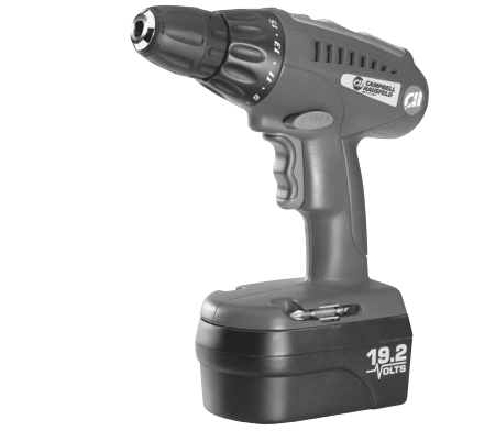
Model DX151905CD - Two Speed Ranges & variable speed trigger

2. Only persons well acquainted with these rules of safe operation should be allowed to use this tool.